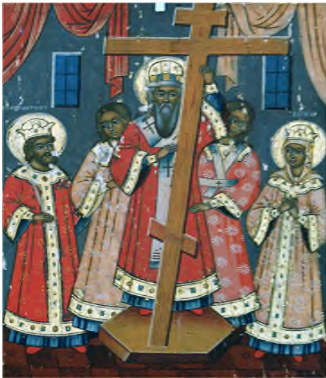
19th century Russian icon, Public domain via Wikimedia Commons

In the center of the icon we can see St Macarius, on the pulpit, holding the True Cross of Christ 'with fear and trembling'. On the right, and at a lower level, there is the Empress Saint Helen facing the Cross and motioning in petition. A smaller or larger group of clergy and lay people is also shown, depending on the icon. They are all attending the magnificent event. In some variations of the icon, on the left