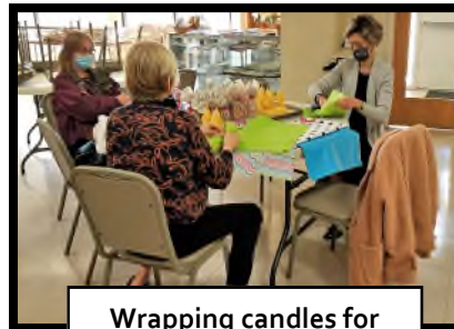
Wrapping candles for Holy Supper Kits.

MBAS UPDATE It was a great joy for the Myrrh Bearers Altar Society to continue the tradition of the Nativity Holy Supper,