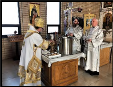
THEOPHANY: BLESSING OF WATER